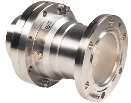
318EIA Connector for HCA300 Cable