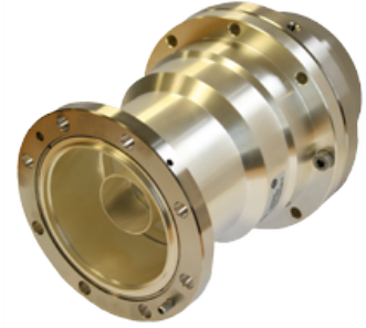
Connector 3-1/8" EIA