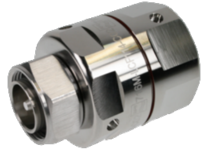
OMNI FIT™ Standard Connectors