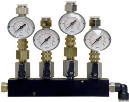
PWM4GC : 4-Port Manifold with Pressure Gauges & Check Valves

Start-up and Manifold Kits - GLK and MLK, and Maintenance Kits