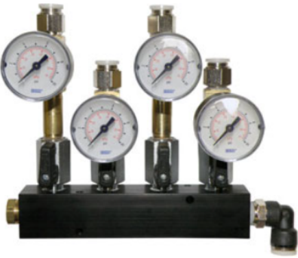
PWM4G : 4-Port Manifold with Pressure Gauges