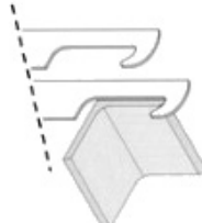
Type L For angle iron (in different sizes)