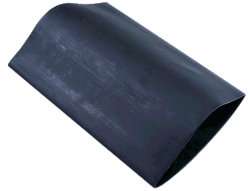
1pcs shrink tube out of pack of 20

RFS Technologies Weatherproofing Heat Shrink Tube pack are designed to be used with RFS Technologies Field-installable OMNI FIT connectors that works on RFS Technologies DragonSkin™ 2HB12-50JPLR cable to gain outstanding additional weatherproofing feature in addition to RFS Technologies OMNI FIT Connectors' own weatherproofing performance. Each pack contains 20pcs individual tube which could work specifically together with RFS Technologies field-installable OMNI FIT™ C02 & C03, D01 & E01 high performance connectors to improved network performance, reduces the number of dropped calls and avoids revenue losses.