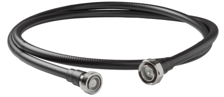
7M7FS12F-0400FFP for EXAMPLE

Radio Frequency Systems' CELLFLEX® Factory-Fit Jumpers feature specially designed connectors which are soldered-on in a strictly controlled industrial process to ensure industry leading performance for today's high-performance wireless systems. The connector design and manufacturing process has been optimized to produce premium VSWR and IM levels. Injection molded boots provide reliable and repeatable additional sealing level and strain relief. Our facilities produce and stock all popular lengths as required by the industry, and can deliver custom lengths with premium VSWR and IM levels on request.