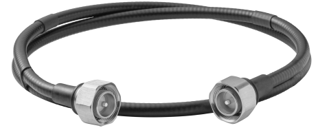
f. e. 43M43MS14-0100FFP

Radio Frequency Systems' CELLFLEX® Factory-Fit Jumpers feature specially designed connectors which are soldered-on in a strictly controlled industrial process to ensure industry leading performance for today's high-performance wireless systems. The connector design and manufacturing process has been optimized to produce premium VSWR and IM levels. Injection molded boots provide reliable and repeatable additional sealing level and strain relief. Our facilities produce and stock all popular lengths as required by the industry, and can deliver custom lengths with premium VSWR and IM levels on request.