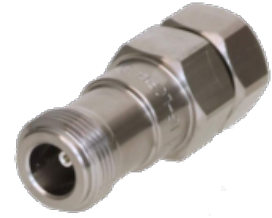
OMNI FIT™ Premium Connectors