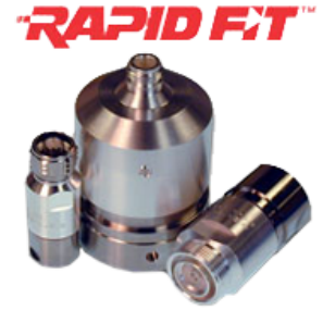
RAPID FIT™ Connectors