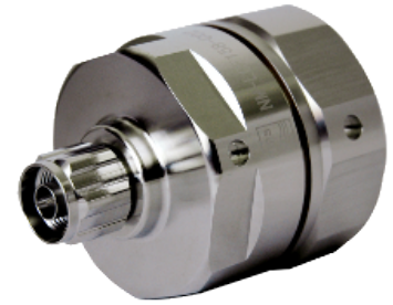
OMNI FIT™ Standard Connectors