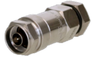
OMNI FIT™ Premium Connectors