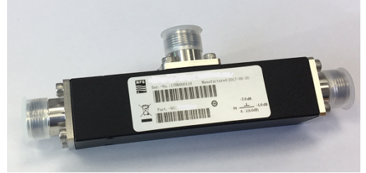
TPS15-43-694/3800 (similar product illustration)