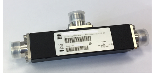
TPS6-43-694/3800 (similar product illustration)