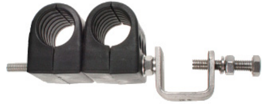
picture shows MBHS78-2-F for illustration purpose