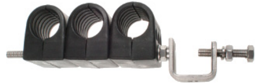
picture shows MBHS78-3-F for illustration purpose