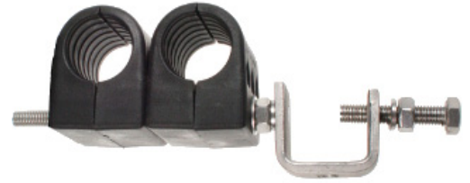
picture shows MBHS78-2-F for illustration purpose