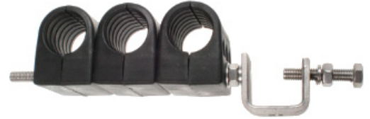
picture shows MBHS78-3-F for illustration purpose