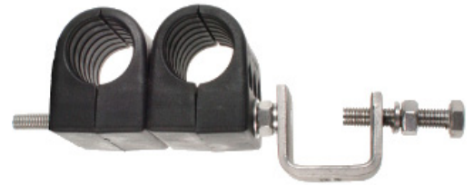
picture shows MBHS78-2-F for illustration purpose