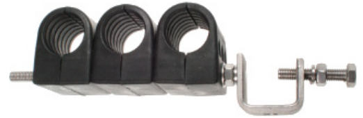
picture shows MBHS78-3-F for illustration purpose